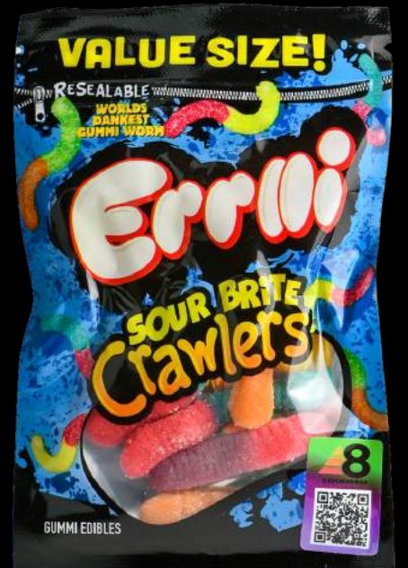
ERRLLI SOUR BRITE CRAWLERS