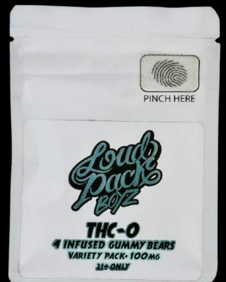
LOUD PACK BOYZ THC-0