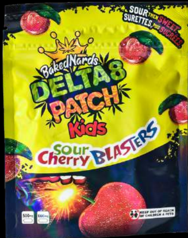
BAKED NARDS D8 PATCH KIDS