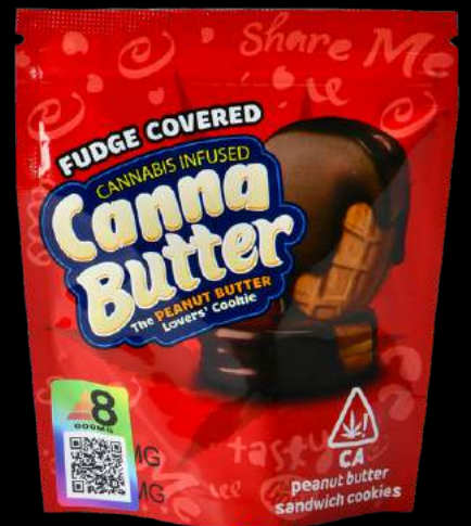
CANNA BUTTER FUDGE COVERED