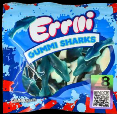
ERRLLI GUMMI SHARKS