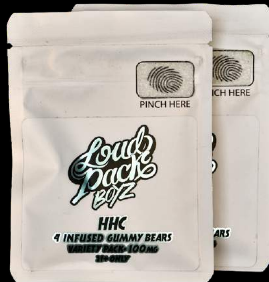
LOUD PACK BOYZ HHC