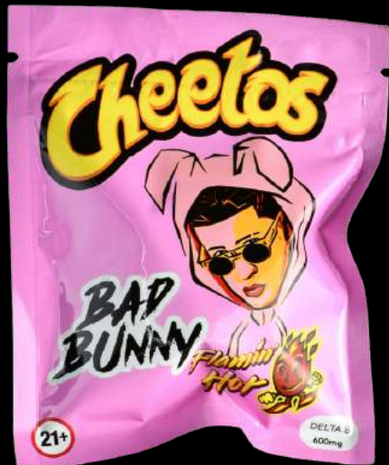
FLAMIN HOT CHEETOS BAD BUNNY