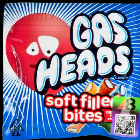
GAS HEADS SOFT FILLED BITES