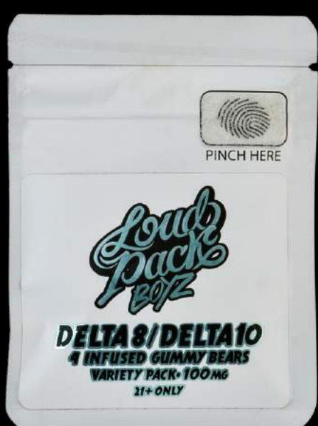
LOUD PACK BOYZ D8/D10